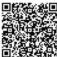
MedTech Award 2022: Alveolix

The success of Bern's medical technology, co-developed with medical professionals is evident in the national recognition by three MedTech award wins within the last decade for solutions developed at the ARTORG Center for Biomedical Engineering Research.